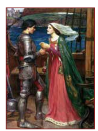
Tristan and Isolde

Gnostic heresy taught European literature its rhetoric of passion