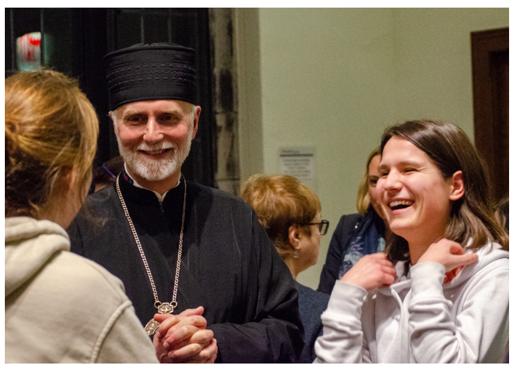
Continued on Page 5

Churches must help give greater voice to Ukrainians in the narrative about the ongoing war in their country, instead of allowing conflicting narratives of world powers to dominate, said a scholar from Boston College, specializing in the intersection of geopolitics, religion and human rights. Elizabeth H. Prodromou, whose most recent work deals with Russian influence-building through religious