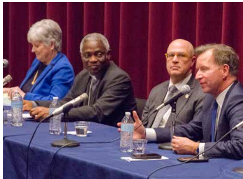
ons on March 21. LEFT: Cardinal Turkson listens to a panel discussion on ei answers an audience question at the public symposium on March 20.

Funding for the public symposium of “Financial Markets and Moral Inquiry” was generously provided by the Our Sunday Visitor Institute, which is supporting an effort by Lumen Christi to reach “the nones” (religiously unaffiliated persons, especially of the millennial generation) at the University of Chicago. Polling numbers suggest that an increasing number of young Americans, including former or non-practicing Catholics, do not understand Catholicism to be capable of sustaining them and giving them meaning amid the exigencies of modern life. Consequently they labor under misconceptions about the nature of Catholic teaching and practice, presuming the Church to be irrational, authoritarian, and antagonistic toward the ethos of a globally connected world. “Financial Markets and Moral Inquiry,” as well as being an important chapter in Lumen Christi’s Program in Catholic Social Thought, is an effort to help manifest the richness of the Catholic intellectual tradition to a broad public.