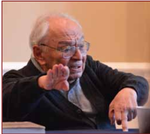
Peruvian Theologian Gustavo Gutiérrez