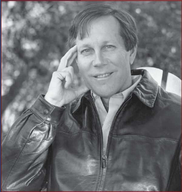
Poet Dana Gioia

NEWSLETTER OF THE LUMEN CHRISTI INSTITUTE FOR CATHOLIC THOUGHT AUTUMN 2013