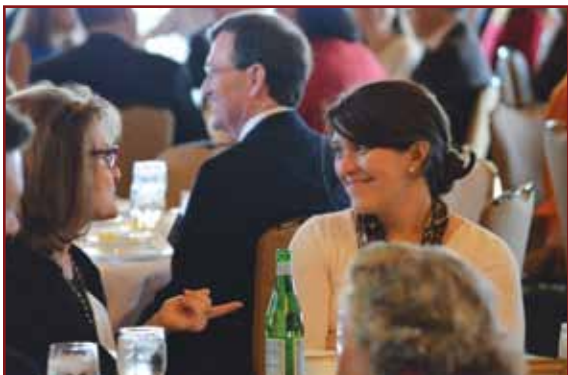
Guests engage in conversation at luncheon prior to Dana Gioia's talk on "Why Beauty Matters" (Oct 17)