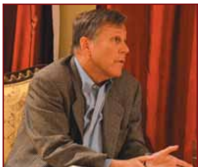
Dana Gioia reads a selection of his poems at Gavin House the evening of October 17th

“What beauty gives us,” he said, “is a mysterious joy, beyond the power to possess.” It gives us also a heightened perception of the shape or meaning of things. The vision may be disturbing, as in a hawk swooping down on its prey, but it is connected to a sense of the truth.