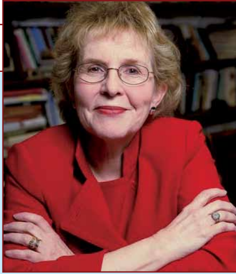
Jean Bethke Elshtain