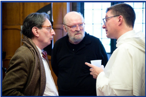
Jean-Luc Marion, David Tracy, and Gilles Emery, OP