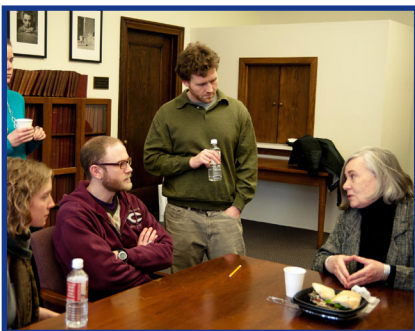
Marilynne Robinson with students at luncheon

In February, The Lumen Christi Institute welcomed Pulitzer Prize-winning novelist Marilynne Robinson to the University of Chicago campus. Robinson is the author of three highly acclaimed novels: Housekeeping , Gilead , and Home . Housekeeping was included in The New York Times Books of the Century and is listed as one of the 100 greatest novels of all time by the UK Guardian Observer . Gilead was awarded the 2005 Pulitzer Prize for Fiction, and Home received the 2009 Orange Prize for Fiction. She is also the author of The Death of Adam: Essays on Modern Thought and Absence of Mind: The Dispelling of Inwardness from the Modern Myth of the Self . She has written for Harper's , The Paris Review , and The New York Times Book Review . The Institute collaborated with the Committee on Creative Writing, the Committee on Social Thought, and the Department of English, to organize her visit.