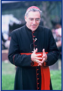
Cardinal Jean-Marie Lustiger, Archbishop of Paris (1981-2005)