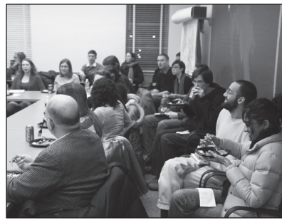
“Philosophers, Theologians and Mystics” Winter Quarter