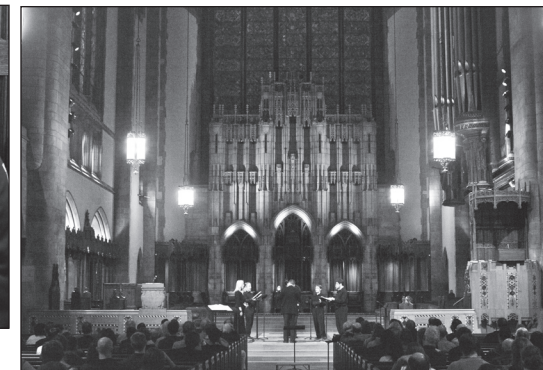
“West Meets East” at Rockefeller Memorial Chapel