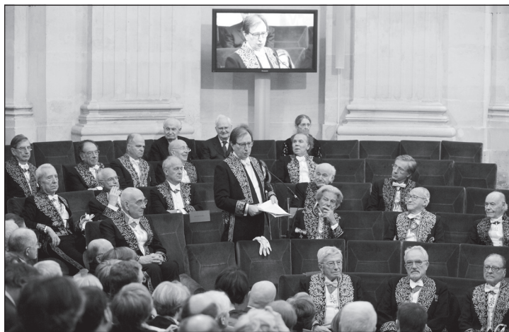
Jean-Luc Marion inducted as member of the prestigious Académie française