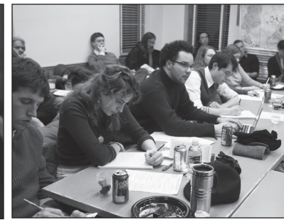
Students enjoy a lecture in the “Philosophers, Theologians and Mystics” series during the Winter Quarter