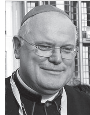
Reinhard Marx, Archbishop of Munich and Freising

Reinhard Marx, Archbishop of Munich and Freising—Pope Benedict XVI's former diocese—paid a visit to Chicago in April while on a broader American tour that included Washington, D.C., New York City, and the University of Notre Dame where Marx presented the 2009-10 Terrence R. Keeley Vatican Lecture entitled "The Social Message of the Church in the Context of Contemporary Challenges." Marx is a respected social theorist and has recently written an analysis of global capitalism entitled Das Kapital , alluding to the famous work of that title by Karl Marx, to whom the forward of the Archbishop's book is addressed. Critical of both capitalism and communism, Marx has gained a reputation for trying to draw attention to how Catholic social thought can provide ways of approaching the current global economic crisis. Communism was disastrous, but "capitalism without humanity, solidarity, and justice has no morals and no future," Marx writes.