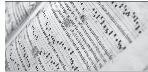
Copy of Turin Manuscript on display at Rockefeller Memorial Chapel