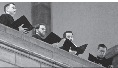
Schola Antiqua begins performance of “West Meets East”