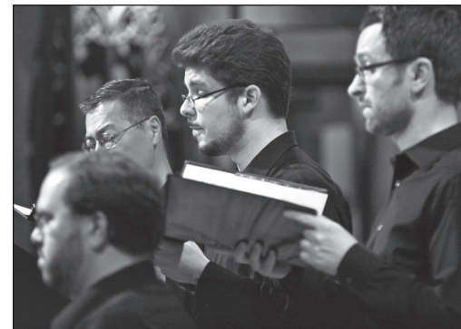
Members of Schola Antiqua of Chicago performing “West Meets East: Fifteenth Century French Sacred Music from Cyprus”