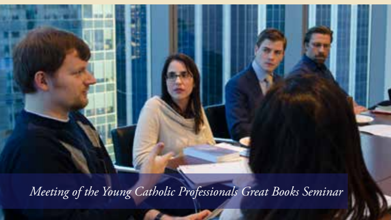
Meeting of the Young Catholic Professionals Great Books Seminar

Young Catholic Professionals intends to host another seminar cycle in 2020. Registration information for that seminar will be available on the group's website.