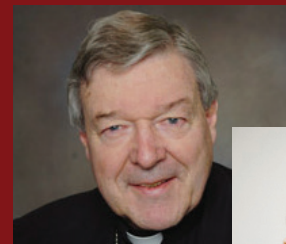
George Cardinal Pell

Lumen Christi will join eight other international institutions to co-sponsor this important event: Konrad-Adenauer-Foundation (Berlin); Markets, Culture and Ethics – Research Centre of the Pontifical University of the Holy Cross (Rome); IESE (Barcelona); Chair of Business Ethics; The Catholic University of America (Washington DC); Pontificia Universidad Católica de Chile (Santiago de Chile); Katholische Sozialwissenschaftliche Zentralstelle Mönchengladbach; and Universidad de Navarra, Facultad de Economía (Spain).