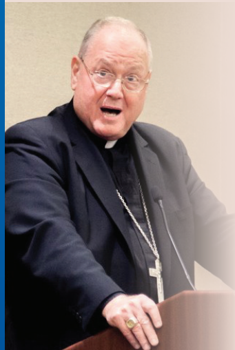
Timothy Cardinal Dolan

on December 15, 2015, that celebrated the book A Godly Humanism , which Cardinal George completed nine days before his death.