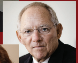
Dr. Wolfgang Schäuble