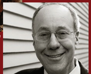
Prof. Roger Myerson