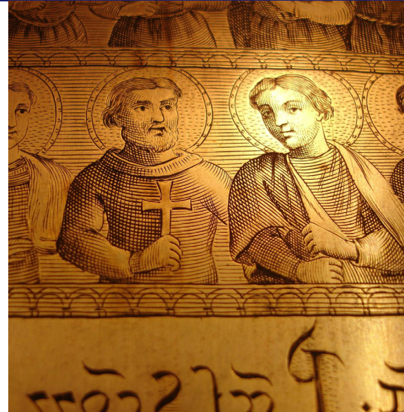
A copper engraving of the Holy Brothers of Benevento.