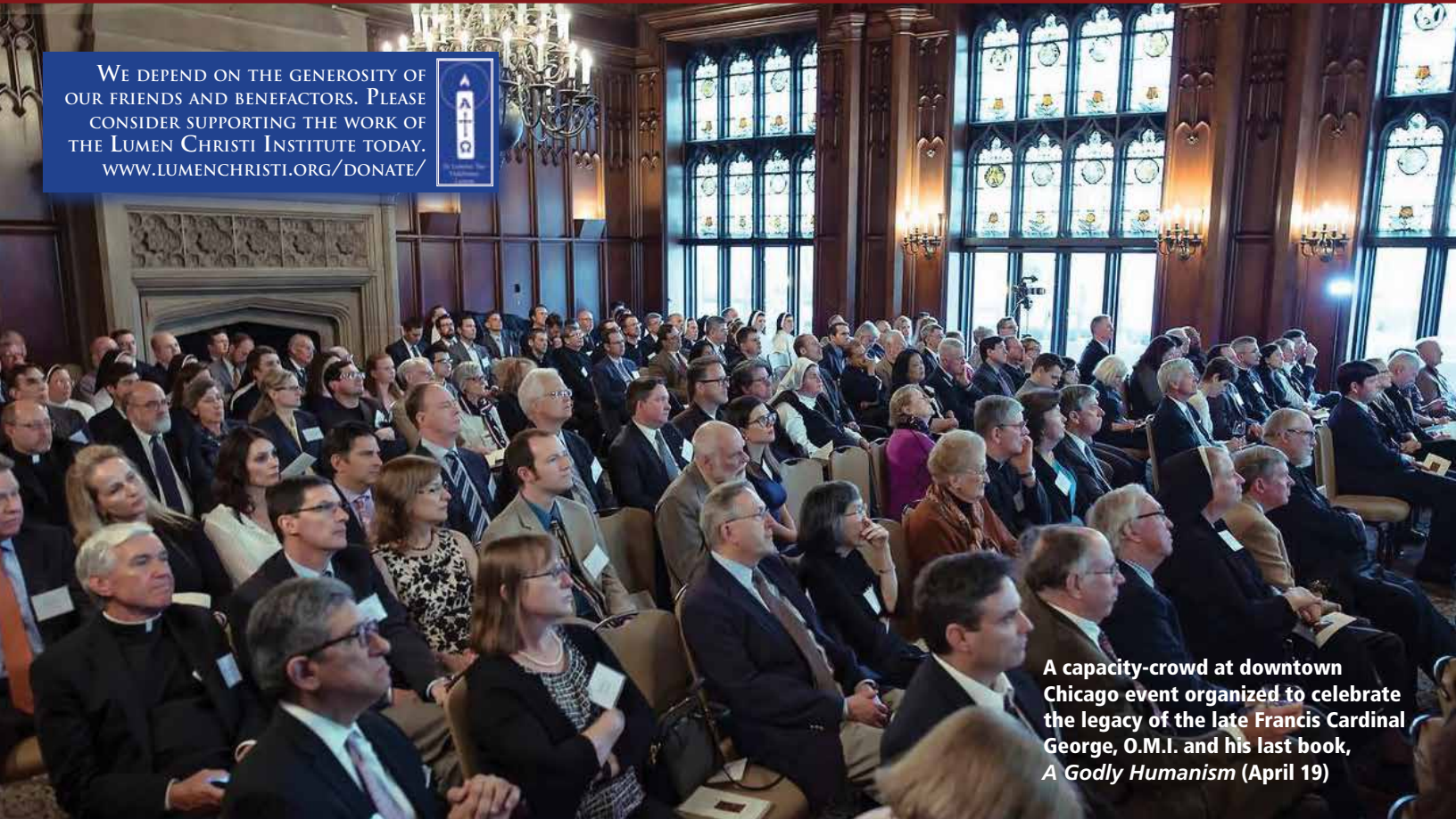
A capacity-crowd at downtown Chicago event organized to celebrate the legacy of the late Francis Cardinal George, O.M.I. and his last book, A Godly Humanism (April 19)