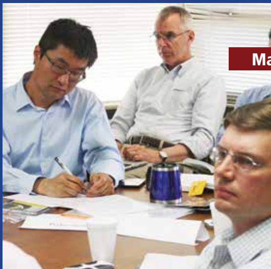
Fifteen graduate students and junior faculty in Economics and Finance attended an inaugural seminar on Economics and Catholic Social Thought at the University of Notre Dame. The event was cosponsored by the Catholic Research Economists Discussion Organization and the Notre Dame Center for Ethics and Culture