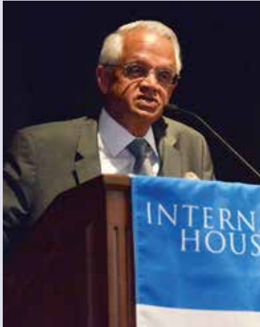
V. Ramanathan (The University of California, San Diego)