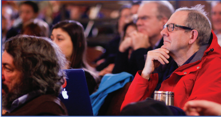
Audience members ponder "Evolution and the Catholic Faith"

Evolution, in a nutshell, is a theory of how atoms came to be assembled in certain ways to form biological organisms. At first glance, the theory doesn't appear very threatening.